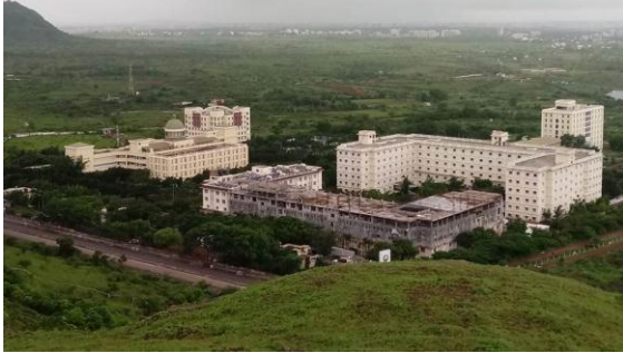
Dr D Y Patil Knowledge City